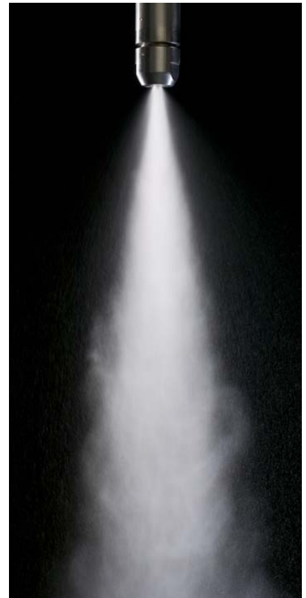
Typical spray from the Niro Two-Fluid Nozzle. Patent pending