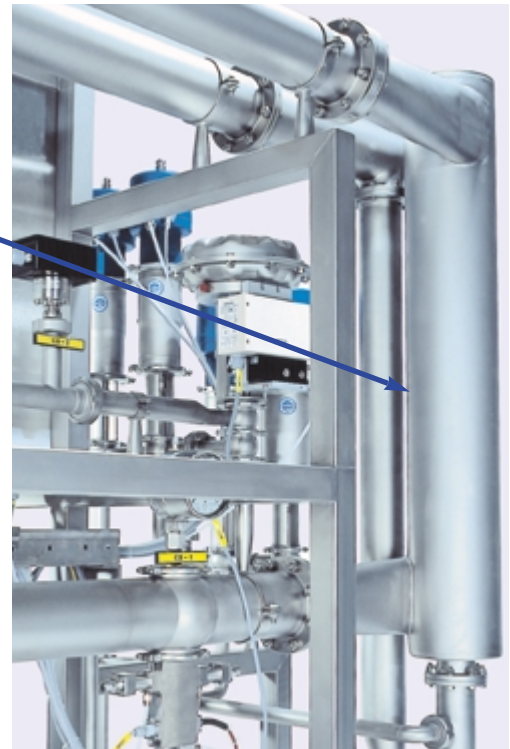
In-Line carbonation with hydrocyclone